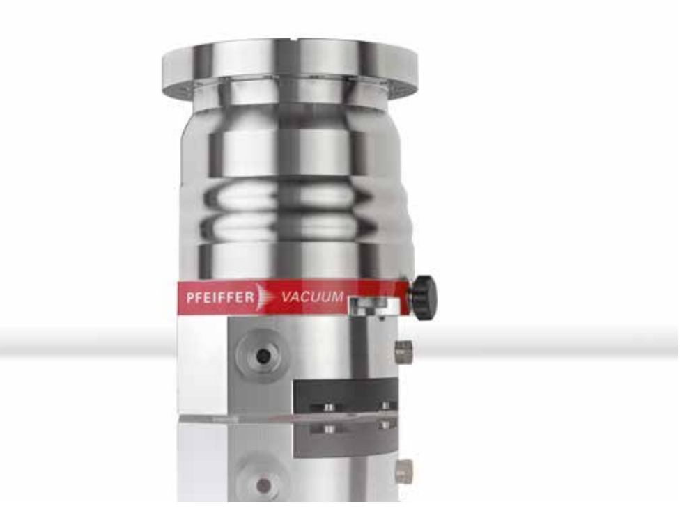
Figure 3: The HiPace turbomolecular pump series has been adapted for use on the ESS.

For the equipment at ESS, the powerful accelerator and the higher neutron flux mean that radiation is even more problematic. The project team had concerns not only about the backing pump, but also about the small amounts of Teflon in the turbopumps. For example, one turbopump contains an electric motor that is insulated with Teflon. Damage to the insulation could lead to an electrical short circuit, which would interrupt the operation of the pump and thus also the course of the experiment.