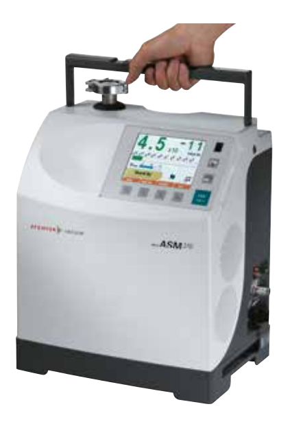
Fig. 5: Portable leak detector ASM 310 from Pfeiffer Vacuum