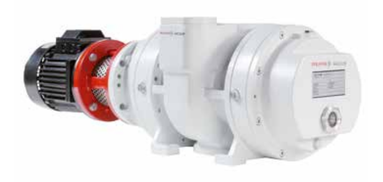
Fig. 3: Pfeiffer Vacuum OktaLine Roots pumps with a magnetic coupling

If rotary vane pumps are used, however, the polymers and liquid wax remain in the oil and are drained away when the oil is changed. This allows the pump to be filled up again with fresh oil and be re-used immediately. The matter of disposing of the oil is therefore the only measure which has to be taken into account.