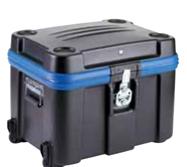
Fig. 6: Portable leak detector MiniTest from Pfeiffer Vacuum and mobile case