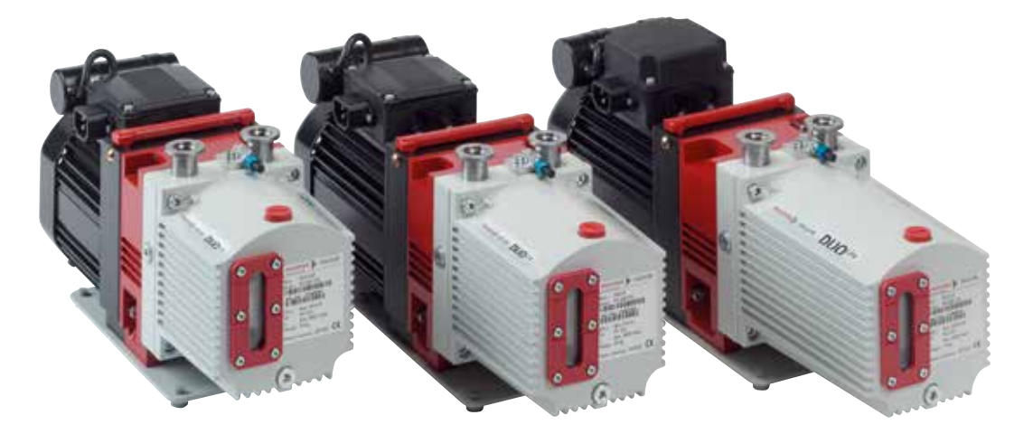
Fig. 2: Pfeiffer Vacuum DuoLine rotary vane pumps cover the pumping speed range of 1.25 to 1,920 m<sup>3</sup>/h

A defined maintenance schedule specifies when tanks must be emptied and tested for leaks and then be refilled with insulating oil or SF_6 gas.