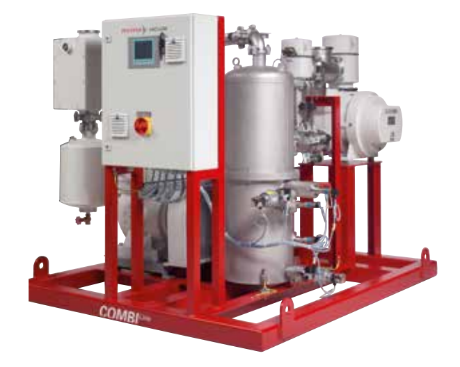
Fig. 1: Pfeiffer Vacuum drying pumping station

The arc interruption properties of sulfur hexafluoride are three times higher than those of air and nitrogen. In view of these properties and its low dielectric losses, SF_6 is ideal for the specific uses named. To maintain the insulating properties, the gas is at a pressure of 5 to 10 bar. This elevated pressure reduces the mean free path of the electrons. The purpose of this reduction is to prevent electrons from accelerating too hard and colliding prematurely with the SF_6 molecules.