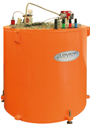
Figure 4: Levisys Flywheel system