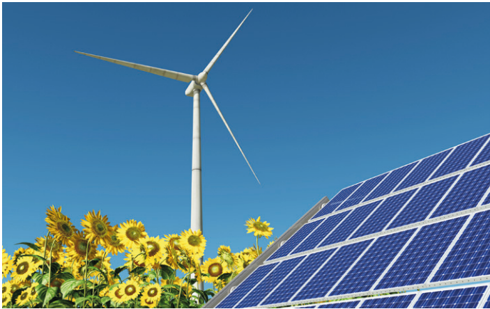
Figure 1: Stationary flywheel systems are used for the short-term storage of solar and wind energy

Although the basic principle of saving energy through a rotating mass can easily be understood, designing an efficient and safe system is quite challenging.