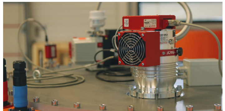
Figure 5: Turbopump, rotary vane pump and Pirani gauge from Pfeiffer Vacuum in use at Levisys