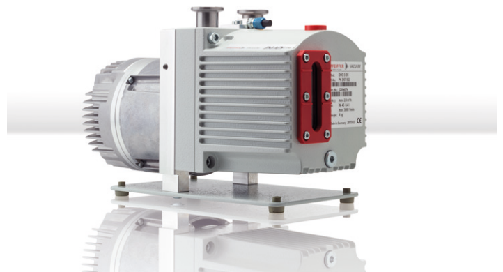
Figure 3: The Duo 3 DC from Pfeiffer Vacuum is the optimal solution for 24 V DC applications

With its dual stage rotary vane pumps of the DuoLine and its popular HiPace turbopumps, Pfeiffer Vacuum offers ideal solutions that match the requirements of flywheel mass storage