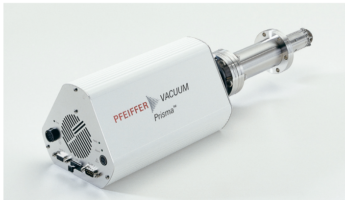
Figure 2: Example of one of the first compact QMS, the Prisma from Pfeiffer Vacuum