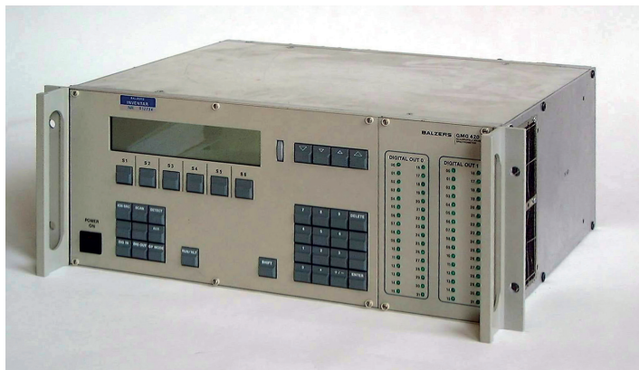
Figure 1: QMS 420 control unit in use in the 1980s

Over the last 30 years, QMS have become more compact, durable, versatile and digital. Their fields of application have broadened.