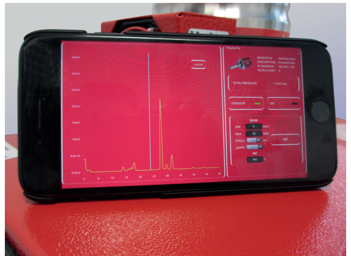
Figure 6: Web UI of a QMS on a smartphone

Second, the continuing miniaturization of the QMS, especially of the analyzers, is another trend. Relatively small rod systems (for example, 12 mm length) have already established themselves on the market – they are also used in larger quantities in high pressure applications. Thanks to its smaller dimensions, such a QMS can be used without additional pressure reduction and without its own pump system for process monitoring up to the pressure range of some E-2 hPa. However, this goes hand in hand with a reduced sensitivity, which decreases by a factor of 100 for 10 times smaller dimensions [7].