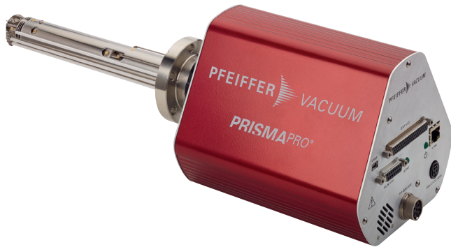
Figure 5: The PrismaPro compact QMS from Pfeiffer Vacuum