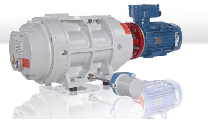
Figure 2: The OktaLine ATEX by Pfeiffer Vacuum