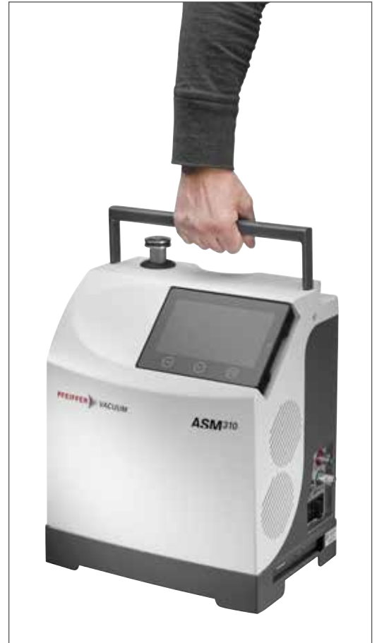
Highly portable with retractable handle