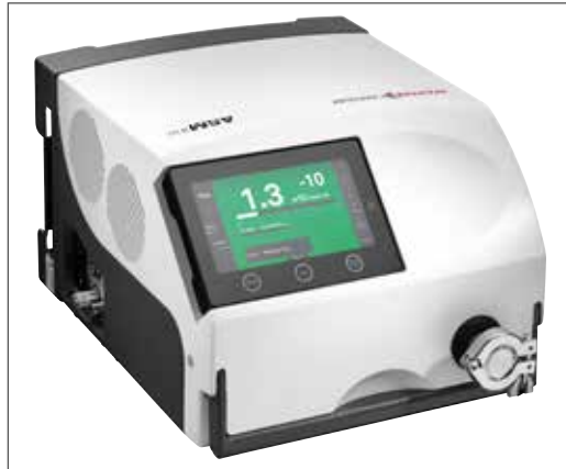
Can be operated in any position

The portable tracer gas leak detector combining ultralight weight and superior performance