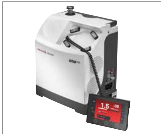
Detachable control panel (with approx. 2 m cable)