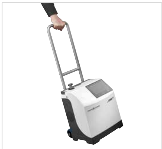
ASM 310 on a trolley