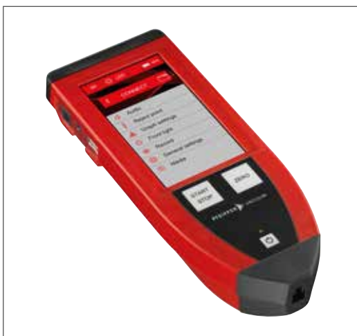
Remote control RC10