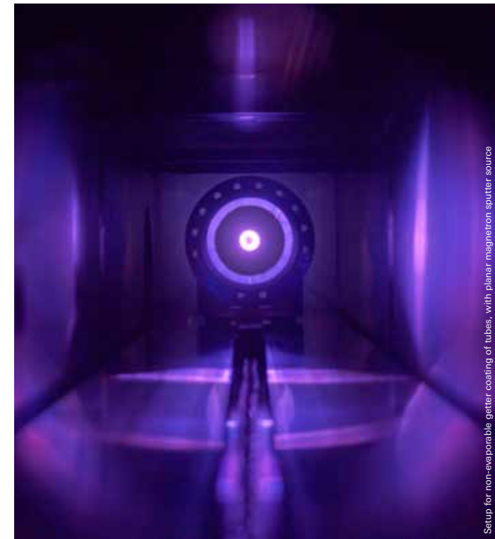
Setup for non-evaporable getter coating of tubes, with planar magnetron sputter source