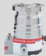
HiPace 300 H