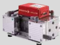
MVP 015-4 DC