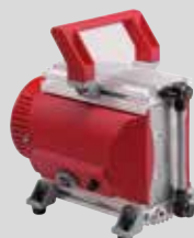
MVP 030-3 DC