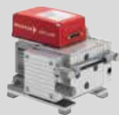
MVP 015-2 DC